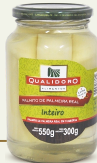
HEARTS OF PALM ROYAL PALM WHOLE 270g = 10,58oz