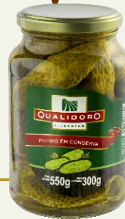
PICKLED CUCUMBER 300g = 10,58oz