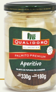
HEARTS OF PALM PUPUNHA PREMIUM APPETIZER 180g = 6,35oz