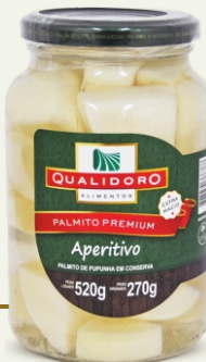
HEARTS OF PALM PUPUNHA PREMIUM APPETIZER 270g = 9,52oz