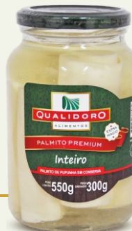
HEARTS OF PALM PUPUNHA PREMIUM WHOLE 270g = 10,58oz