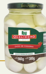
QUAIL EGG 300g = 10,58oz