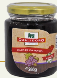
PURPLE GRAPE JAM 260g = 9,17oz