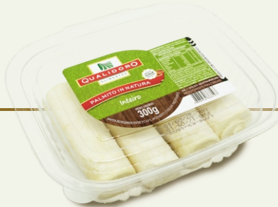
HEARTS OF PALM PUPUNHA IN NATURE WHOLE 300g = 10,58oz