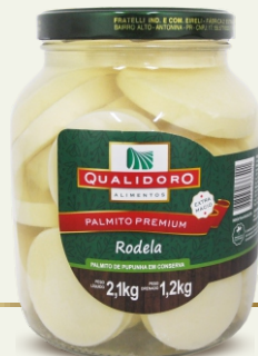
HEARTS OF PALM PUPUNHA PREMIUM SLICED 1,2kg = 2,65lbs 1,8kg = 3,97lbs