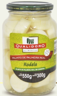
HEARTS OF PALM ROYAL PALM SLICED 270g = 10,58oz