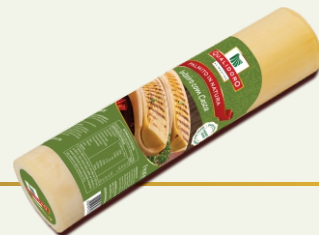
HEARTS OF PALM PUPUNHA IN NATURE WHOLE IN A SHELL 400g = 14,11oz