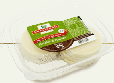
HEARTS OF PALM PUPUNHA IN NATURE MEDALLION 300g = 10,58oz