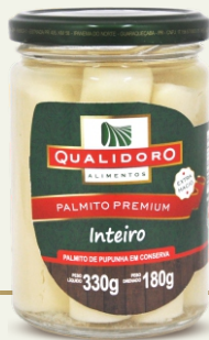
HEARTS OF PALM PUPUNHA PREMIUM WHOLE 180g = 6,35oz