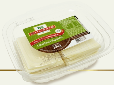
HEARTS OF PALM PUPUNHA IN NATURE LASAGNA 300g = 10,58oz