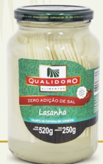
HEARTS OF PALM PUPUNHA SALT FREE LASAGNA 250g = 8,82oz