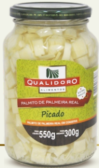
HEARTS OF PALM ROYAL PALM CHOPPED 270g = 10,58oz