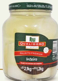
HEARTS OF PALM PUPUNHA PREMIUM WHOLE 1,2kg = 2,65lbs 1,8kg = 3,97lbs