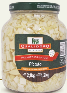
HEARTS OF PALM PUPUNHA PREMIUM CHOPPED 1,2kg = 2,65lbs 1,8kg = 3,97lbs