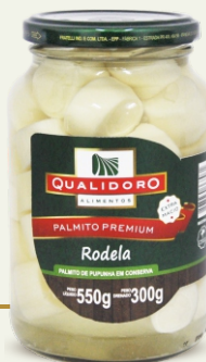
HEARTS OF PALM PUPUNHA PREMIUM SLICED 270g = 10,58oz