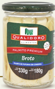
HEARTS OF PALM PUPUNHA PREMIUM SPROUT 180g = 6,35oz