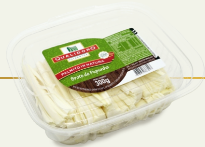
HEARTS OF PALM PUPUNHA IN NATURE SPROUT 300g = 10,58oz