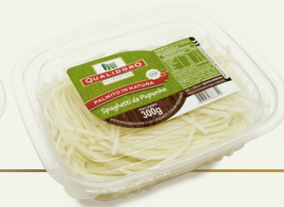
HEARTS OF PALM PUPUNHA IN NATURE SPAGHETTI 300g = 10,58oz