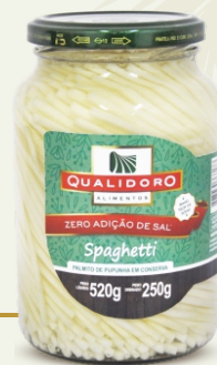
HEARTS OF PALM PUPUNHA SALT FREE SPAGHETTI 250g = 8,82oz