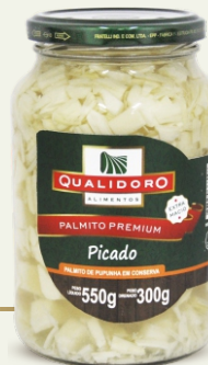
HEARTS OF PALM PUPUNHA PREMIUM CHOPPED 270g = 10,58oz