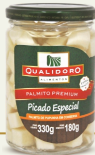
HEARTS OF PALM PUPUNHA PREMIUM SPECIAL CHOPPED 180g = 6,35oz