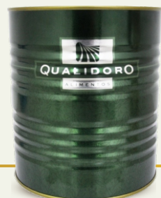
HEARTS OF PALM PUPUNHA PREMIUM CHOPPED (CANNED) 2kg = 4,41lbs